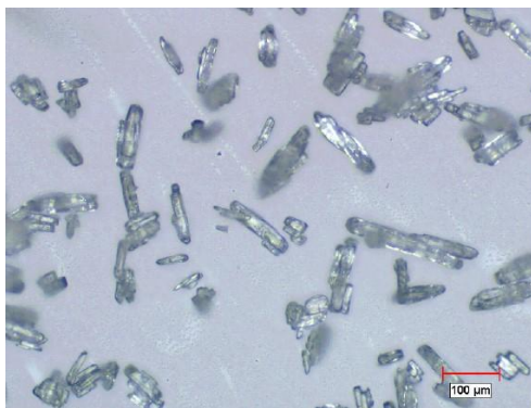
Figure 1: The original image viewed at 100X.